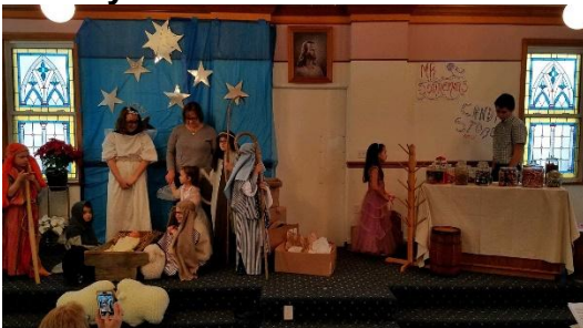
The children who took part in that