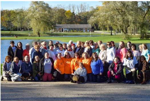
On Sunday afternoon, September 9, many in our congregation attended the baptismal service for