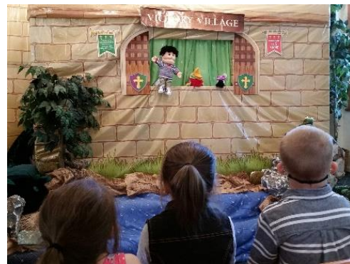
Vacation Bible School Puppet Show