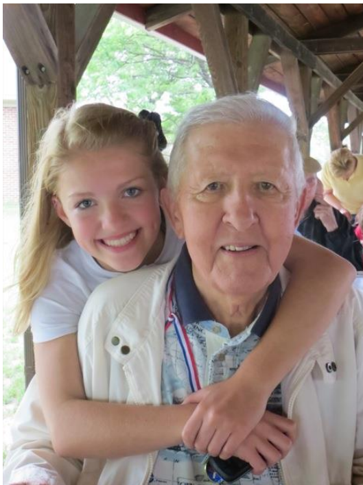
Birthdate Nov. 22, 1928 Heavenly Homecoming March 24, 2016