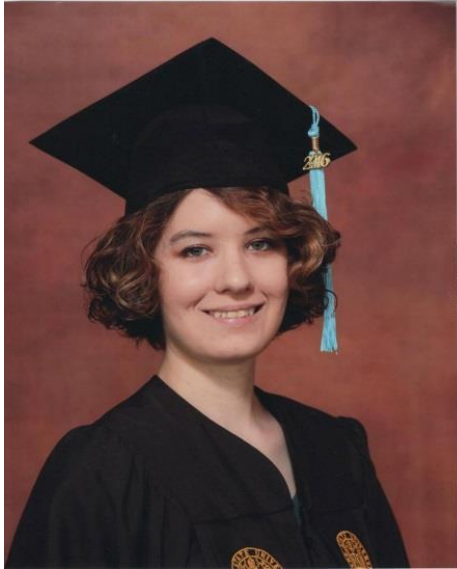
Wayne State University, Mike Illitch School of Business Graduating Class of 2016, Magna Cum Laude